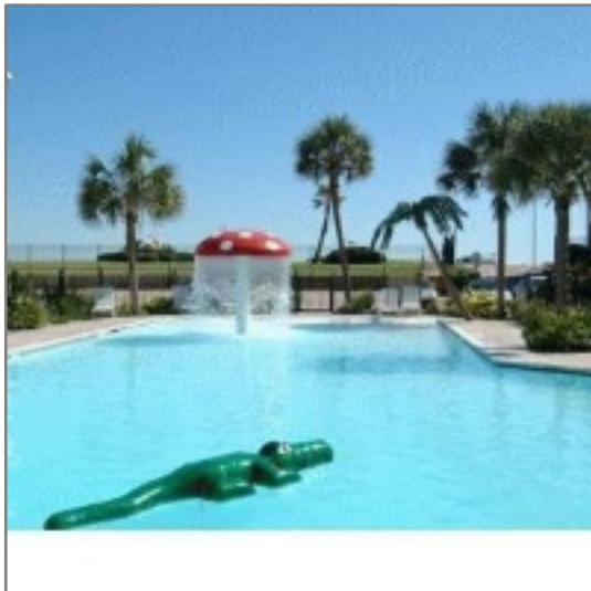
Hotel Room Images