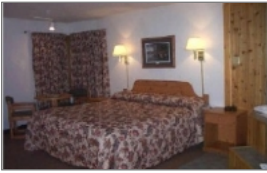
Hotel Room Images