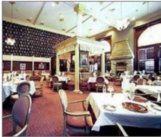
Hotel Room Images